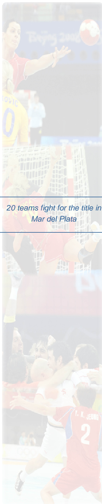
20 teams fight for the title in Mar del Plata