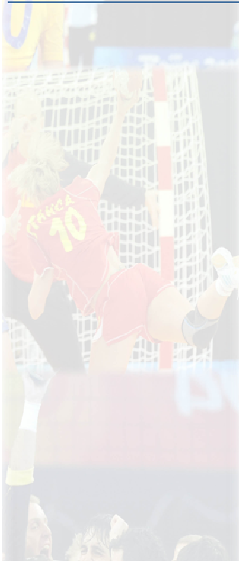
In total 430,000 spectators attended the 98 matches in Sweden