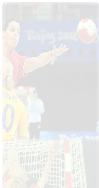
Denmark, Spain and Sweden will host Olympic qualification tournaments in April 2012.