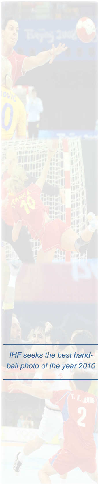
IHF seeks the best handball photo of the year 2010