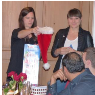
GER couple presenting X-max