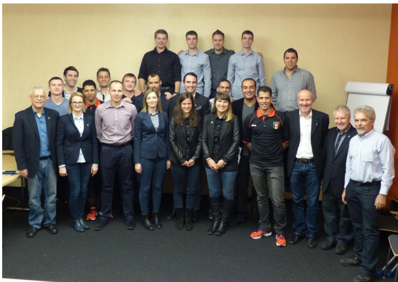
Participants GRTP and ARTP, lecturers and organizer

09. – 14. December 2014 St. Gallen, Switzerland