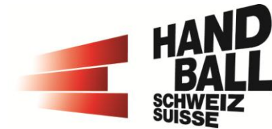
Host Federation for IHF- GRTP and IHF-ARTP