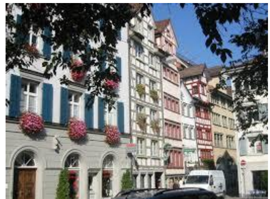
St.Gallen, Host-City of GRTP 2014