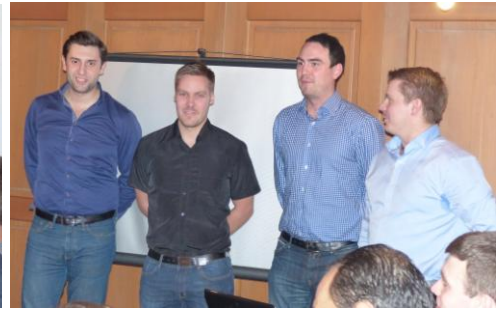
Scandinavian (SWE/FIN) song collaboration