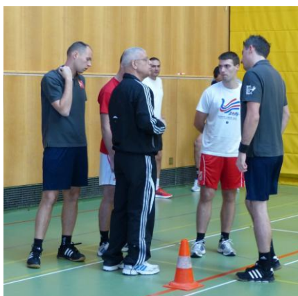
Preparation for shuttle run

As usual in GRTP courses the shuttle run (multistage fitness test) without measuring of lactate was used to check the fitness of the referees. None of the referees had problems to pass the required limits of 9.5 men and 8.5 women.