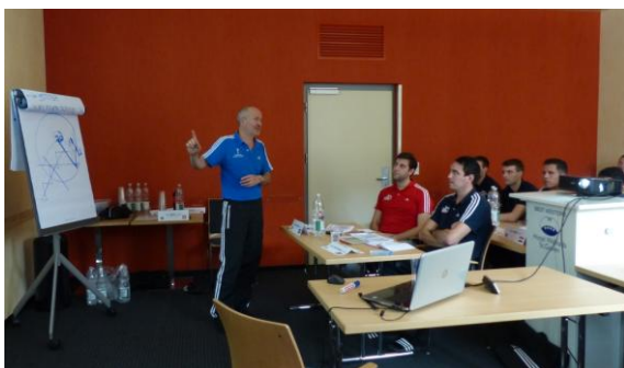
Methodical advices / game analyzes in theory room