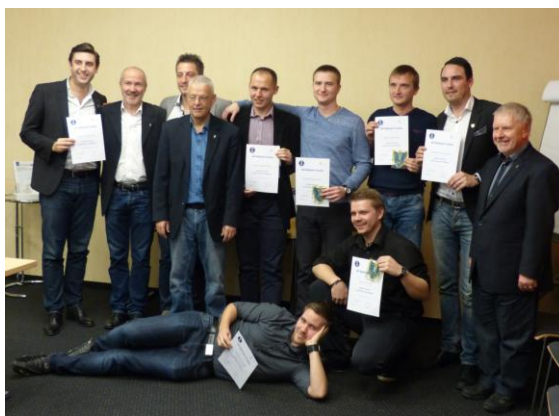
New IHF-Referees and lecturers after GRTP St. Gallen 14