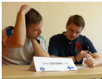
Couples from ROU/FIN – rule test