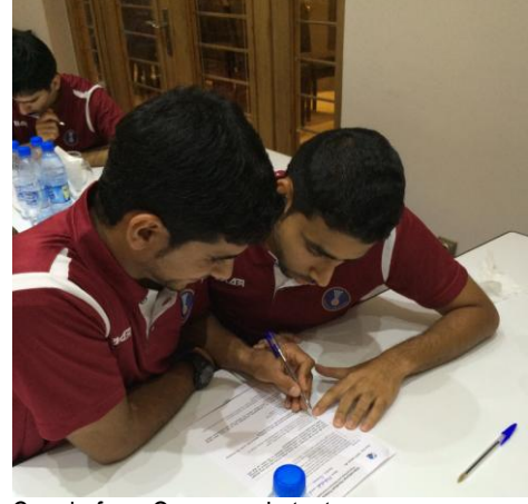
Couple from China - rule test