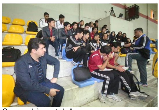
Group work in sports hall

For methodical topics and points of general interest the lecturers had the chance to give their input in respective theory sessions in front of all referees.