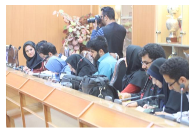
Press Conference prior to the GRTP course