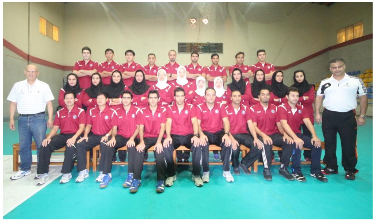
Participants (including guests) and Lecturers of GRTP course Isfahan, Iran