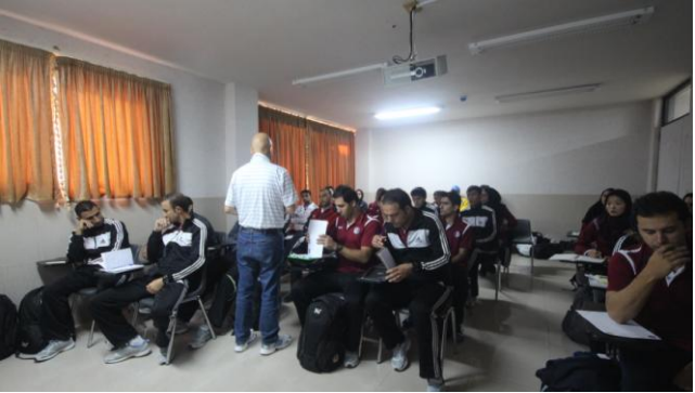
Methodical advices / game analyzes in theory room of sports hall