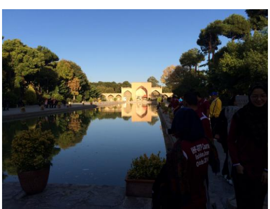
Isfahan, Host-City of GRTP 2014