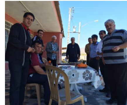
Invitation to lunch in IRI restaurant