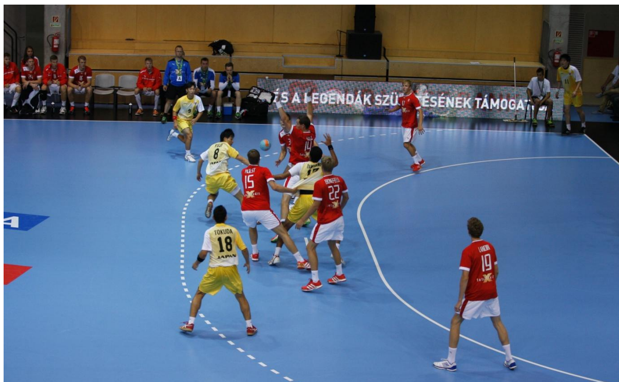
Picture 6. Following a shooting fake, #8 LB passes the ball to the Pivot with a quick wrist pass.