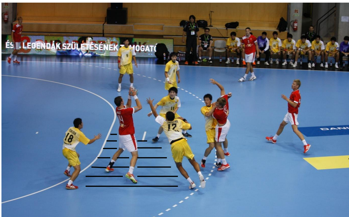
Picture 4. After the ball is received back, RB attacks the goal and LW moves into Pivot position.