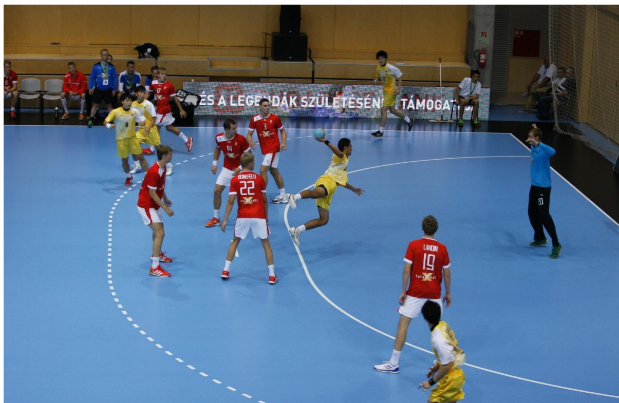
Picture 8. ... then finishes the action in a clear scoring chance with a dive shot.