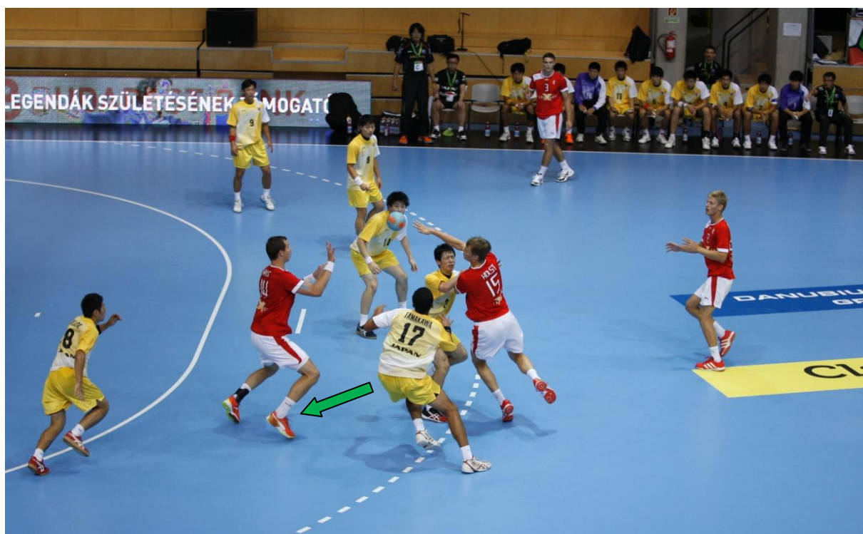
Picture 3. Pivot receives the ball from LB then quickly passes it back to him, while LW runs-in.