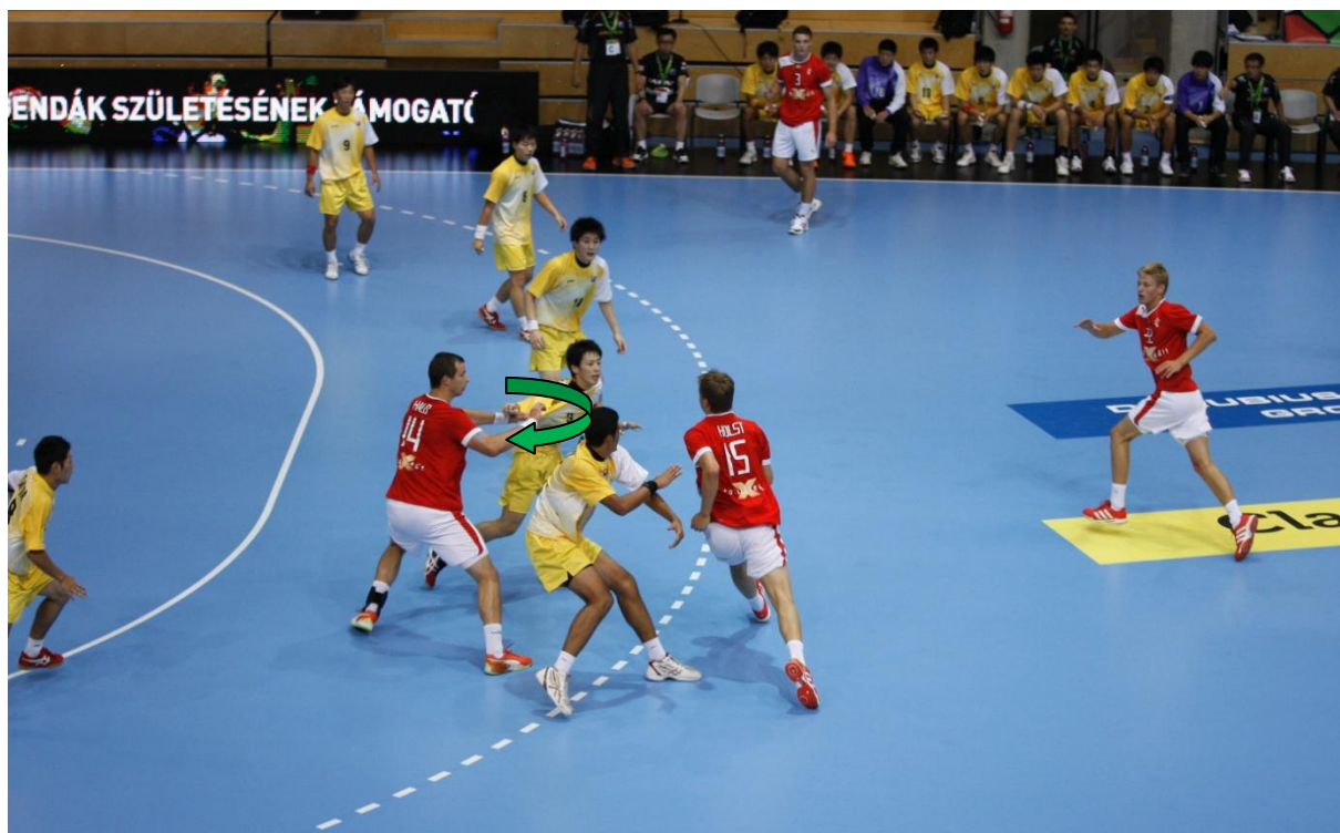
Picture 2. Passing his man, #15 LB forces the RH defender to fall out, while the P frees himself.