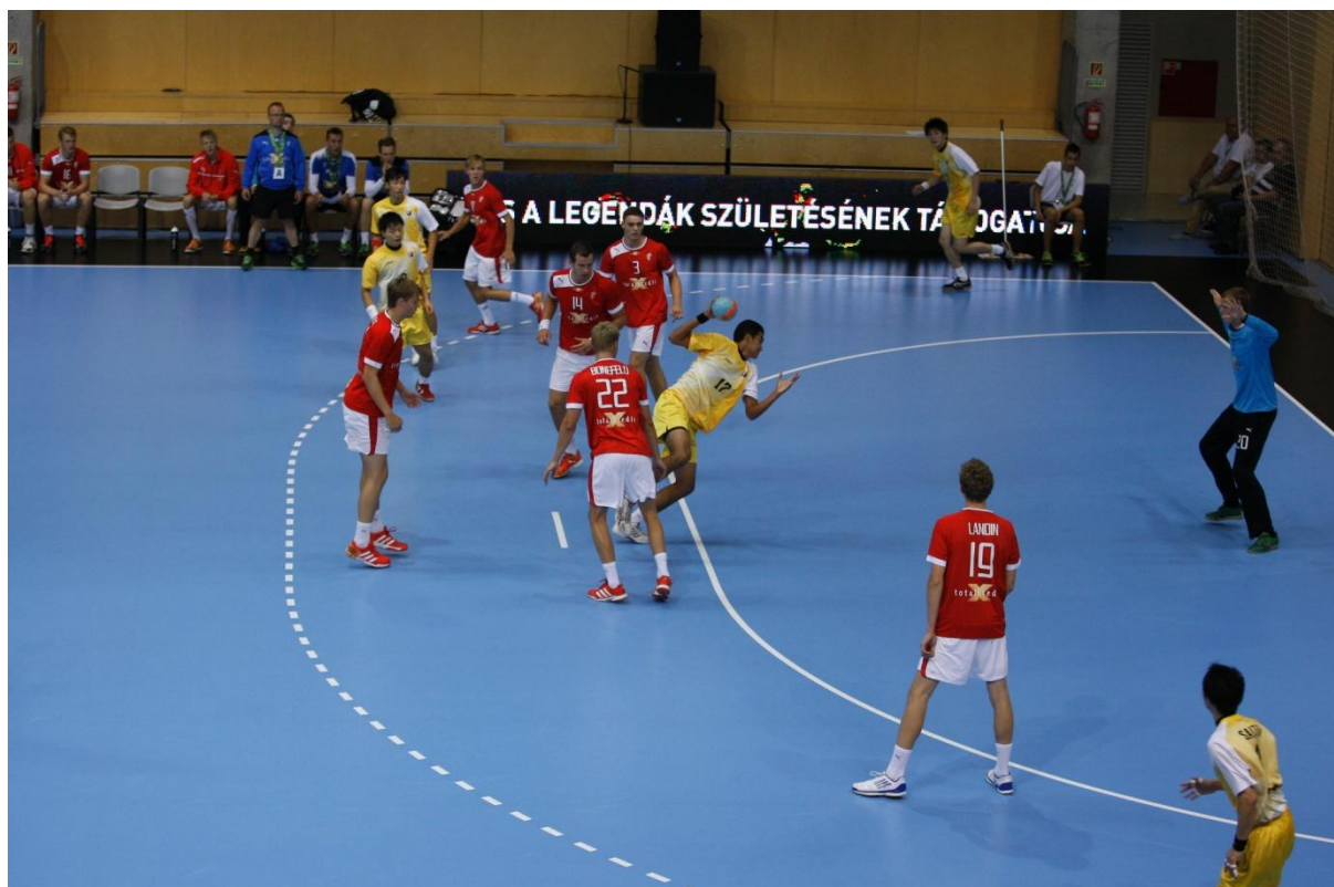
Picture 7. The Pivot frees himself from the defenders and turns to the goal with the ball...