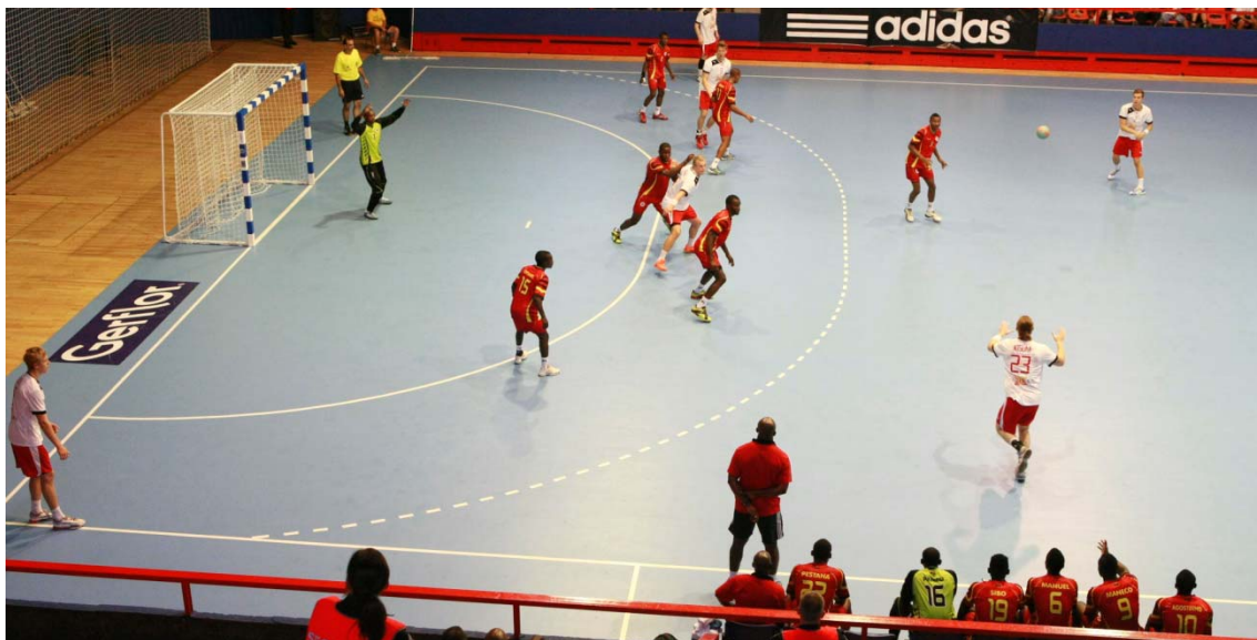
Picture 1. Two line players, the first one on the right side, the second one in the defensive central area: the tactical idea in attack is to have more defenders on the right side and more space on the left side. The CB passes the ball to the LB.