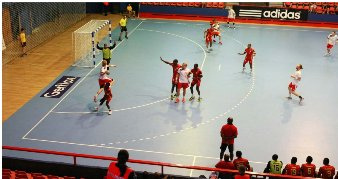
Picture 4. The Danish left winger is willing to throw with the best chances of success for a specialist in this position.