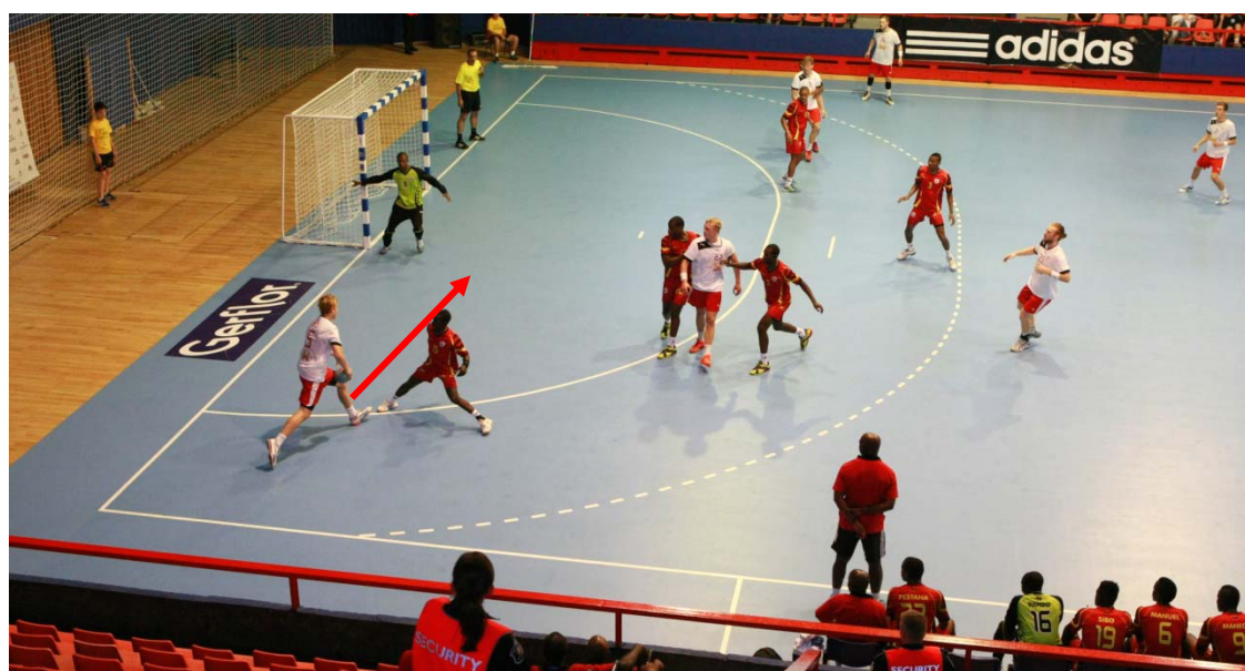
Picture 3. The left winger receives the ball and jumps in the right direction to get the maximum shooting angle. The outside defender does not arrive on time to prevent the shot.