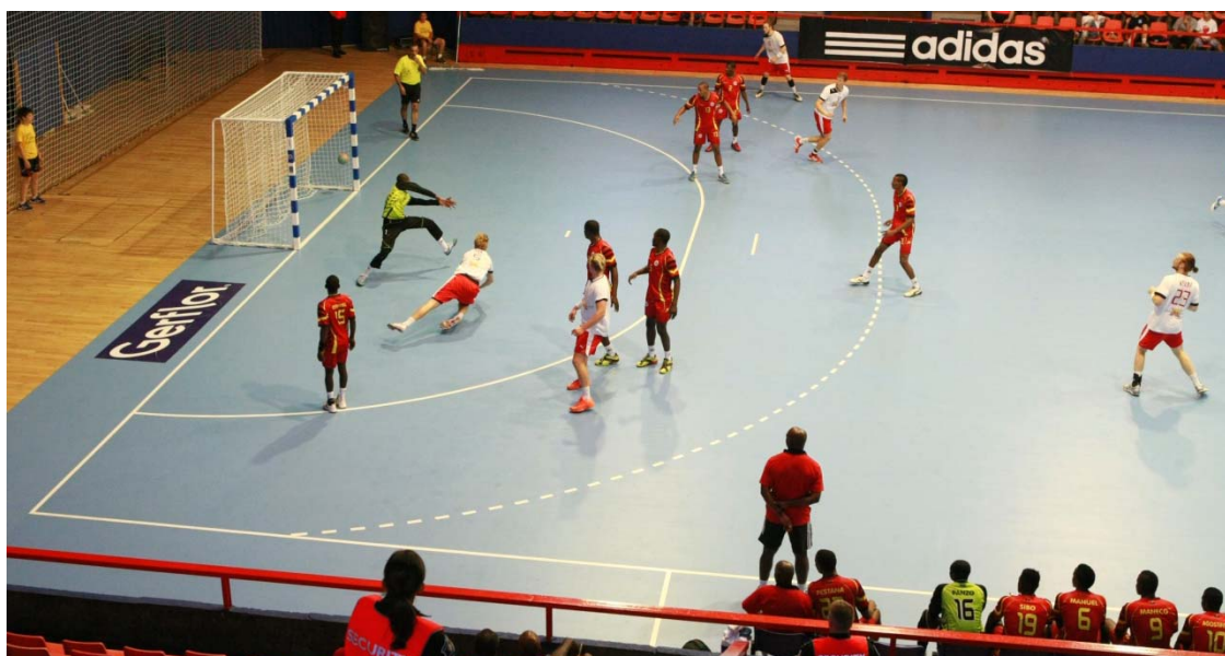
Picture 5 Finally, the winger is shooting in a very good position, strikes the right balance and manages to score a goal.