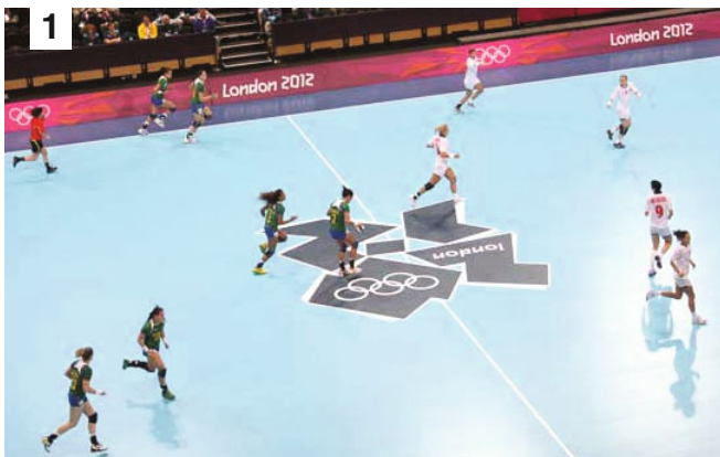
1 The pivot executes the throw-off with a pass to the right wing, who is sprinting.

Serving as an example the following picture row shows Brazil's quickly executed throw-off with help of the right wing that is a concept in attack many men's teams also profit from in the men's tournament.