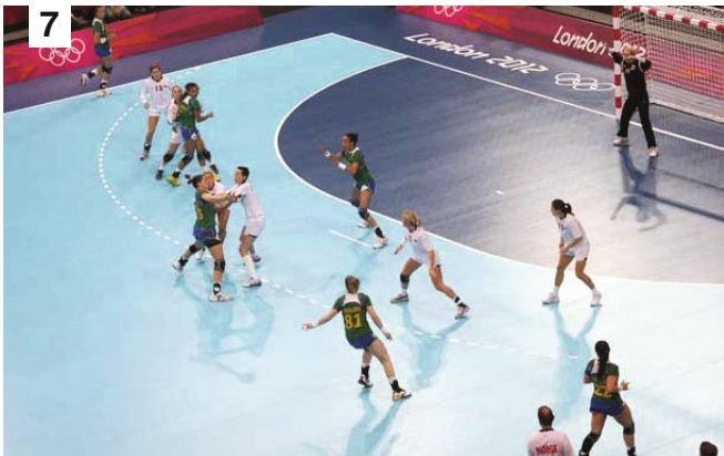
Poor cooperation in defence: The left back is tackled by two defenders.