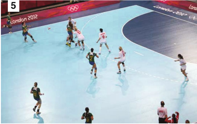
As the defence manages to configure at the free-throw line she bounces the ball to launch a crossing with the left back.