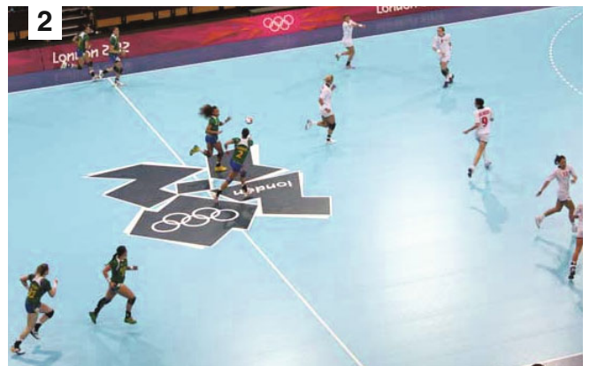
2 The opponent's defenders are still retreating.