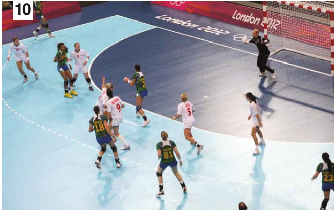
Picture 9 to 12: The pivot catches the ball with one hand, turns to the non-throwing arm side to shoot at the goal.