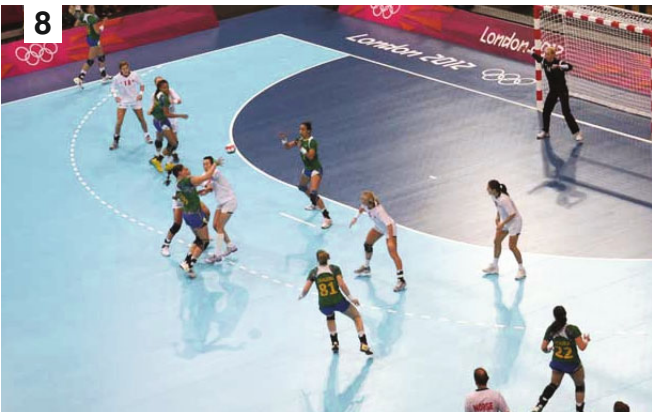
Despite body contact she immediately feeds the pivot.