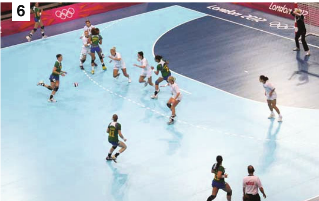
The left back runs a wide curve to the inside while the pivot takes up her position in the centre.