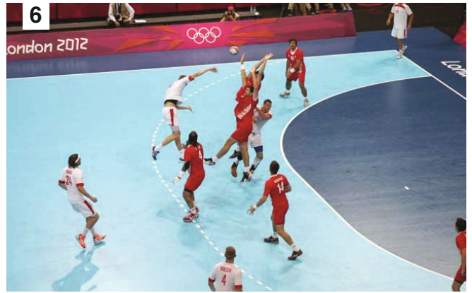
6 Pictures 6 to 8: The defenders' blocking in cooperation with the goalkeeper is successful to spoil the left back's jump shot.