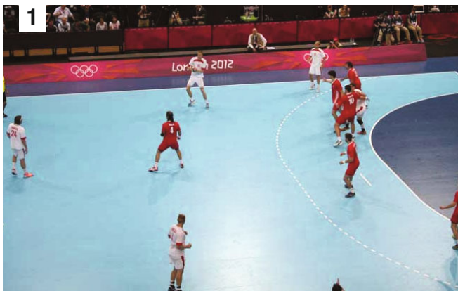
Balic acts in a diagonal position in depth to generally allow a pass to Hansen, who is acting in depth.

Croatia configured in a 5:1 defence to start their match against Denmark. After 11 minutes they switched to 5:0 + 1 to face Denmark's main goal scorer Hansen. Ivano Balic did not play man-on-man against Hansen. Thanks to flexible defence play he managed to disrupt Denmark's attack play again and again.