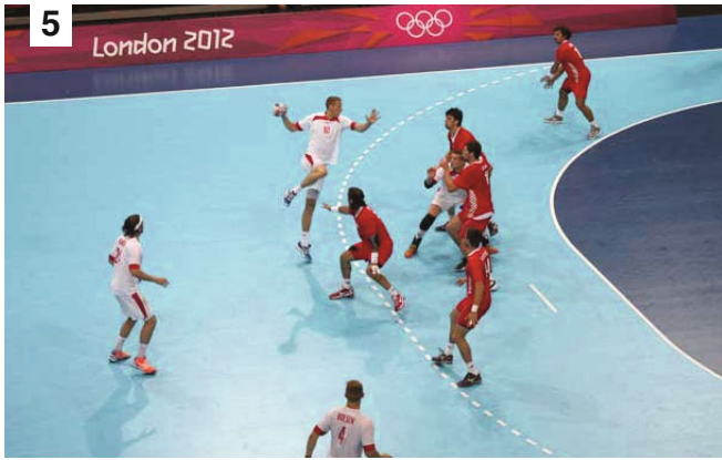
5 The right half and the back centre defender move the pivot forward in order to spoil blocking/moving away.