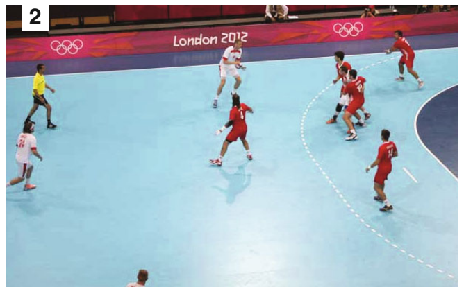
That play mainly urges the left back and the right back to act. The left back starts 2-on-2 on his side.