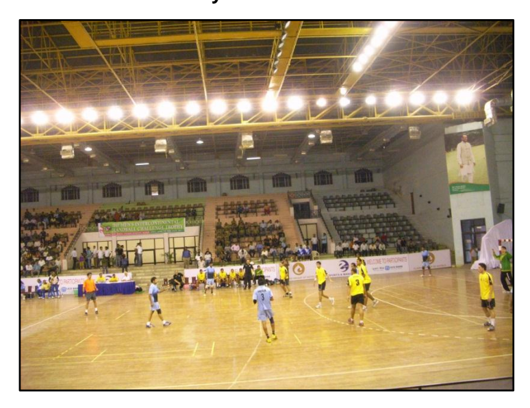
Our colleagues from Paraguay during the match IND - VEN.