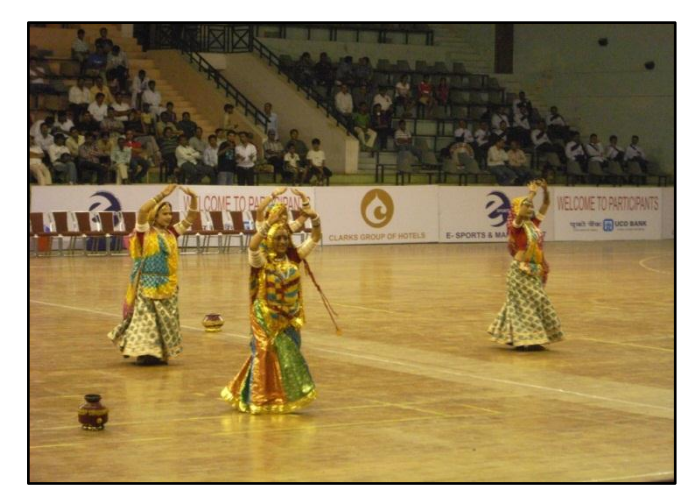
Indian dancers during the opening ceremony.