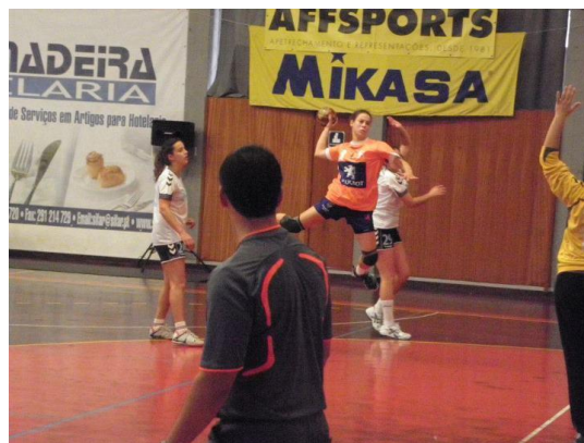
(refereeing youth categories)