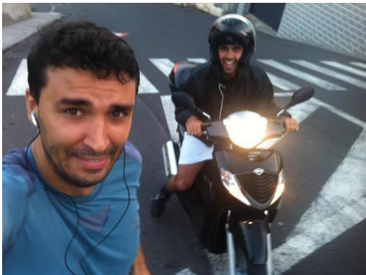
(Running hard ... in motorbike)

To prevent different kinds of defence and attack styles, we asked some experienced coaches in this category about the most difficult points to attack other teams and also frequently used defence styles. All this made our preparation intense but useful as we would experience during the championship.