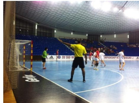
(Korea vs Denmark)

This improved during the second half and in the next matches. We also enjoyed the technical meetings every day. They were useful and provided helpful advice. We kept updated about what happened during the day and about what should be improved for a better quality of the games. The delegates gave useful advices, and we noticed that our performance improved through taking their advice. We plan continuing in that way during the next season in Portugal, which will kick off in September, and during European competitions.