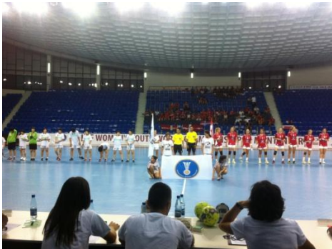
(Korea vs Denmark)

During the championship we had the opportunity to whistle seven matches. The first match we had to whistle was the opening match in Podgorica, so, we were a little bit nervous during the first minutes of the game because our line could be followed by other colleagues. This was well noticed because our whistle signals were too loud and our body language was too restless.