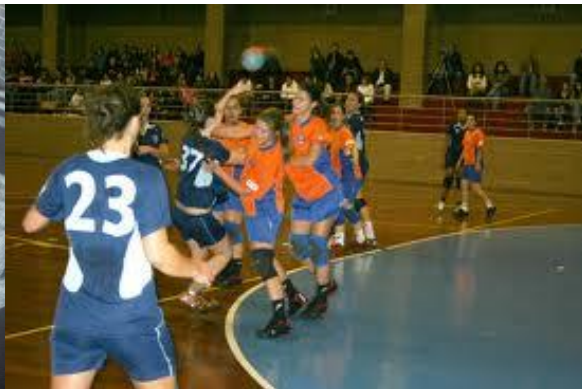
(refereeing youth categories)