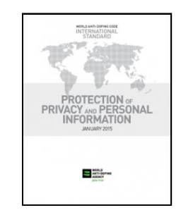
Protection of Privacy and Personal Information