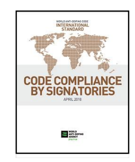
Code Compliance by Signatories